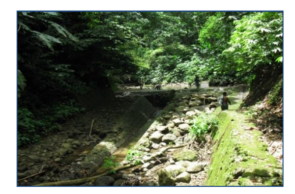
After Hurricane Tomas