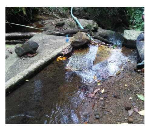
Water Infrastructure - Installation of Meters Non Revenue Programmed (to reduce waste and meet demand)